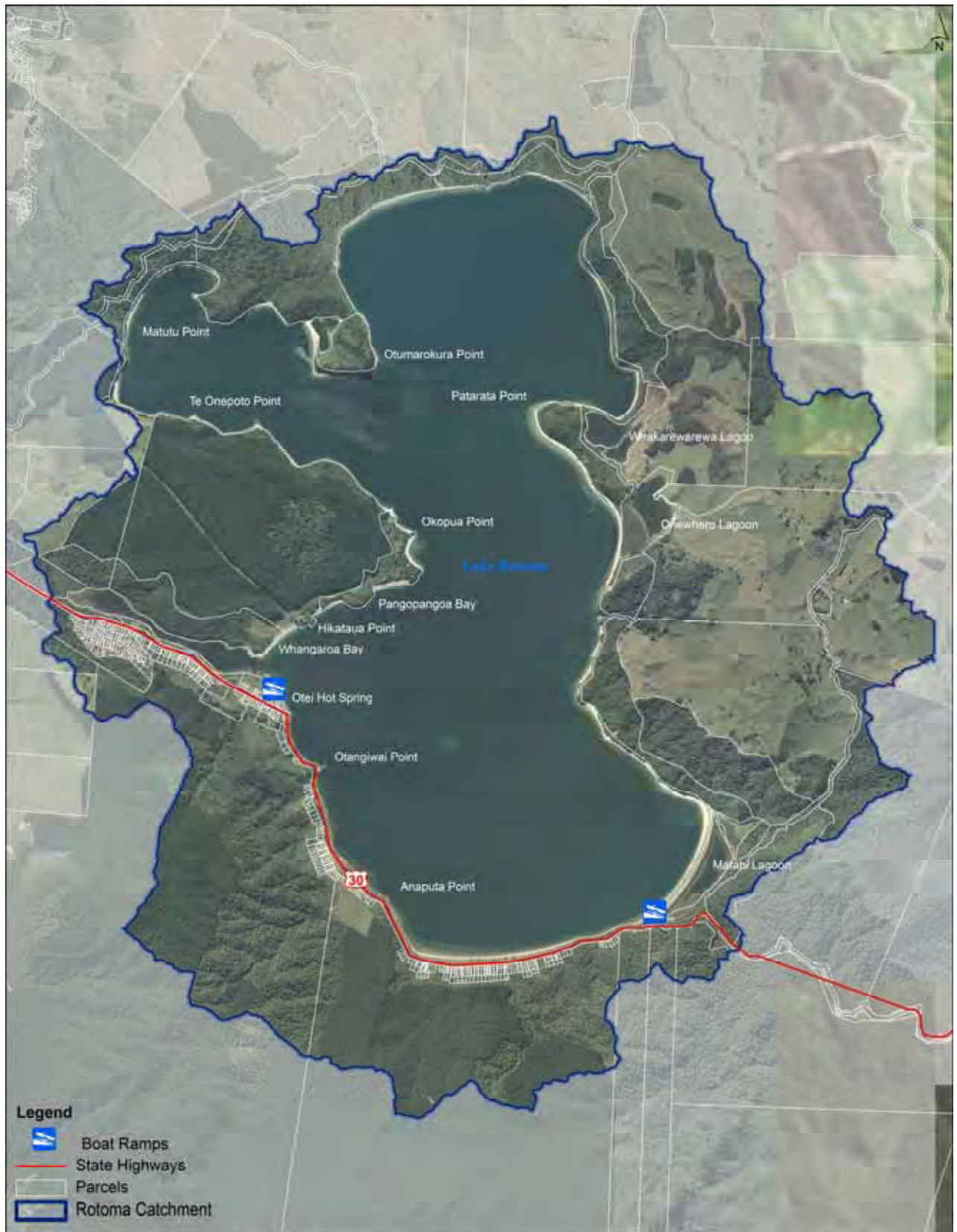
Figure 2 Lake Rotomā catchment

the nutrient status of the lake. As a lake becomes eutrophic (nutrient enriched), the nutrient cycling from lakebed sediments starts to dominate lake water quality.