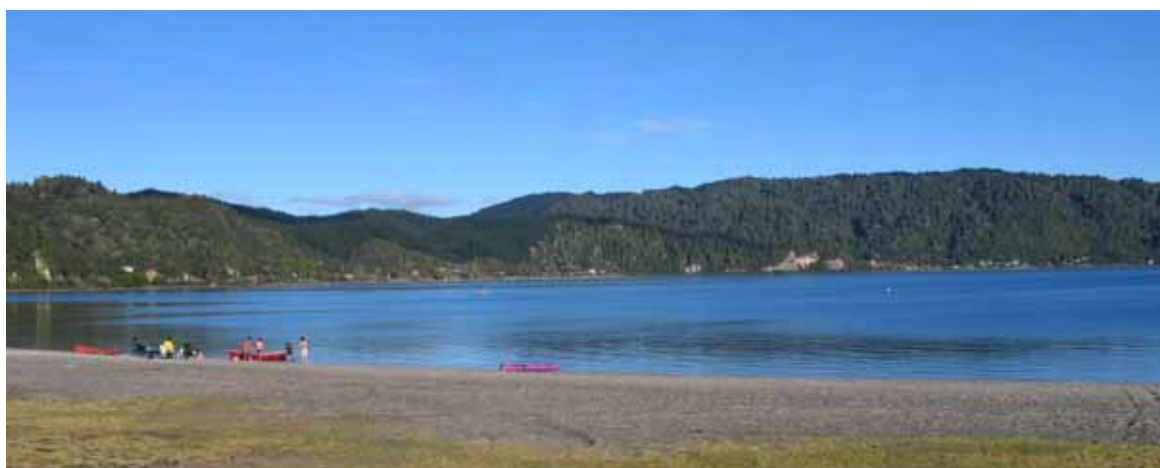
Figure 1 View from Matahi Bay – southern end of Lake Rotomā

Lake Rotomā means clear water. Lake Rotomā is the cleanest of all the Rotorua Lakes, with around 11 metres water clarity.