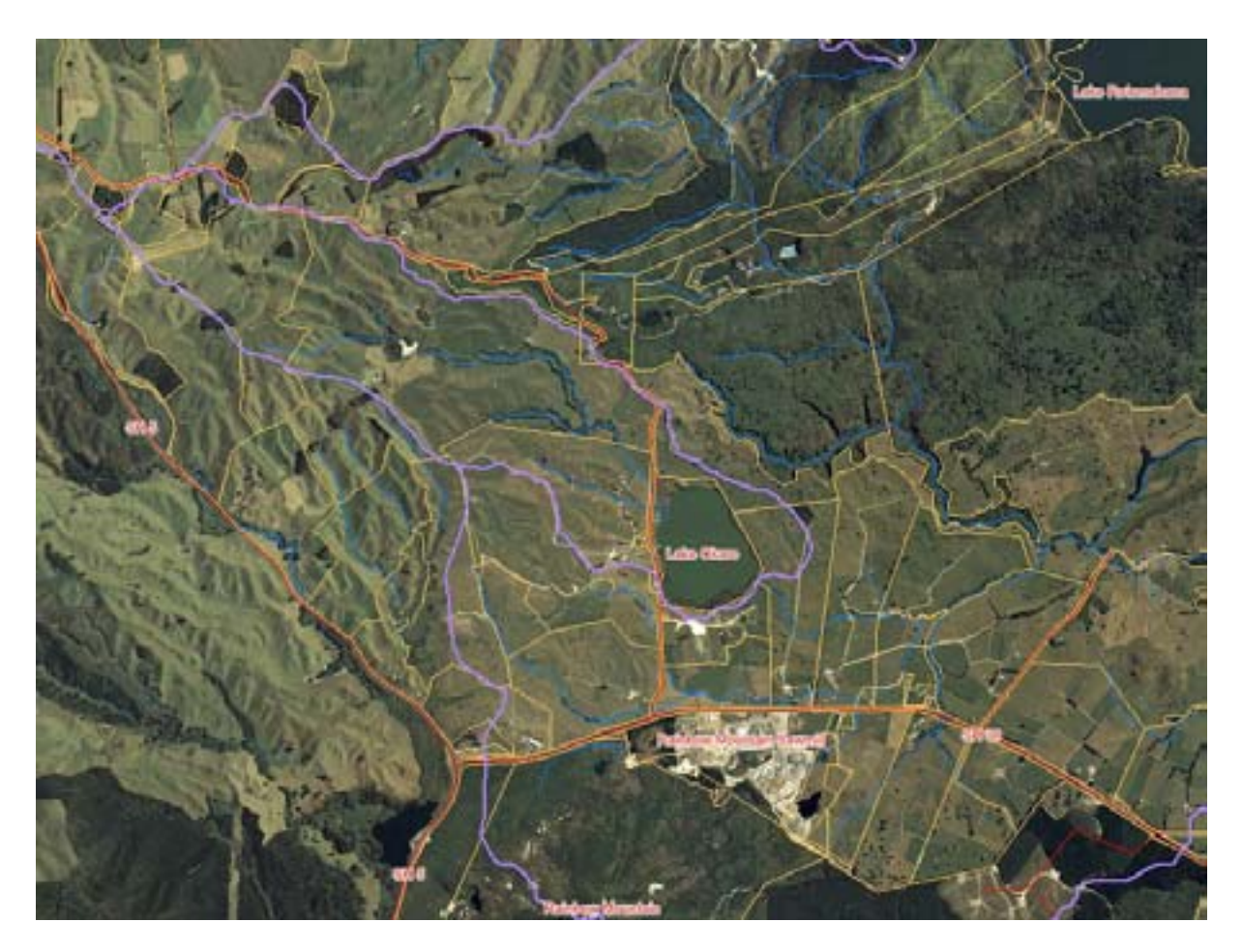
Figure 1 Lake Okaro and surrounding area

Recreational uses of the lake include boating, water skiing and fishing. The Medical Officer of Health warns against contact recreation when cyanobacterial blooms are on the lake. Lake water with cyanobacterial blooms may contain toxins. Drinking these toxins can harm the liver, the nervous system or the gastrointestinal tract. The toxins can affect humans, livestock, birds, and fish to a lesser extent. Skin contact with the toxins may trigger allergic reactions or asthma.