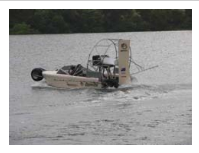
Figure 3 Lake Okaro alum application

The alum sank into the lake on application without affecting the lake's pH. The next day the alum was only partially located but on the following day it was distributed throughout the surface waters. It was surmised that the alum had plunged to the thermocline (the temperature drop between upper and lower waters) and temporarily accumulated there until the surface water currents gradually mixed it. After five days the alum was thoroughly mixed throughout the surface waters.