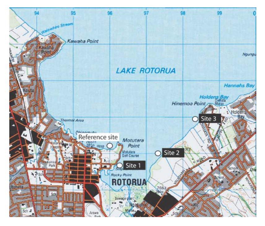
Figure 1: Sample site locations in and around Sulphur Bay.

Water and biota samples were obtained in February 2012 from the same four sites used by Landman & Ling (2009). Three sampling locations were within Sulphur Bay and its receiving environment in Lake Rotorua (Sites 1-3) and an additional site was located outside the bay (Site 4) for reference purposes (see Figure 1). A summary of biota samples analysed from each locality is given in Table 1.