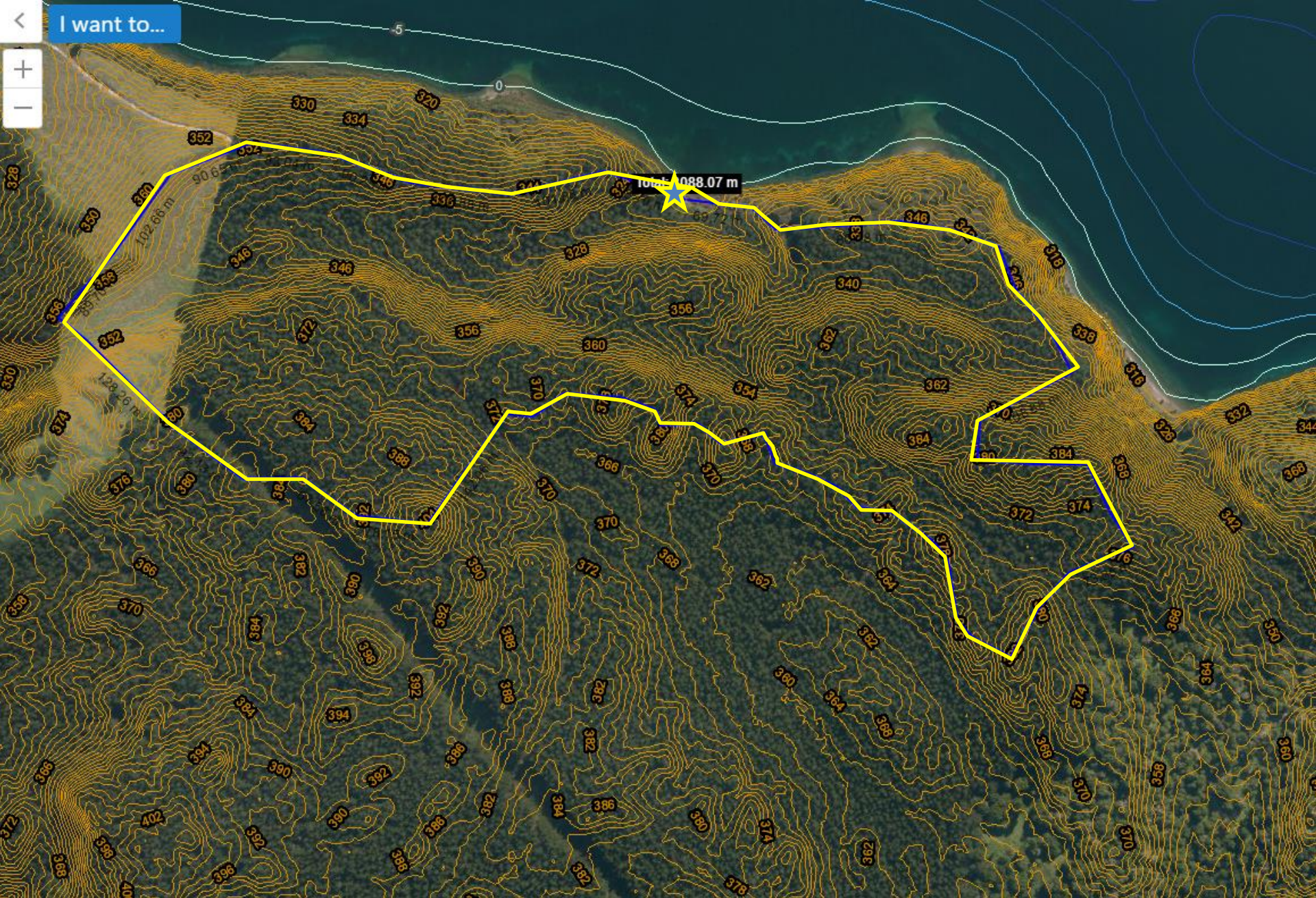
Catchment Approx 32.4ha