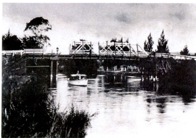
Rotorua Lakes Education Resource – Mourea New and Their Photographs Photos from the Historical Museum of Art and History, Te Whare Toi o Te Arawa, NZ

In conclusion, it was through take tipuna (ancestral right), take raupatu (right of conquest) and ahi kā roa (permanent occupation) that Ngāti Pikiao established their mana whenua over the Rotoiti district..."