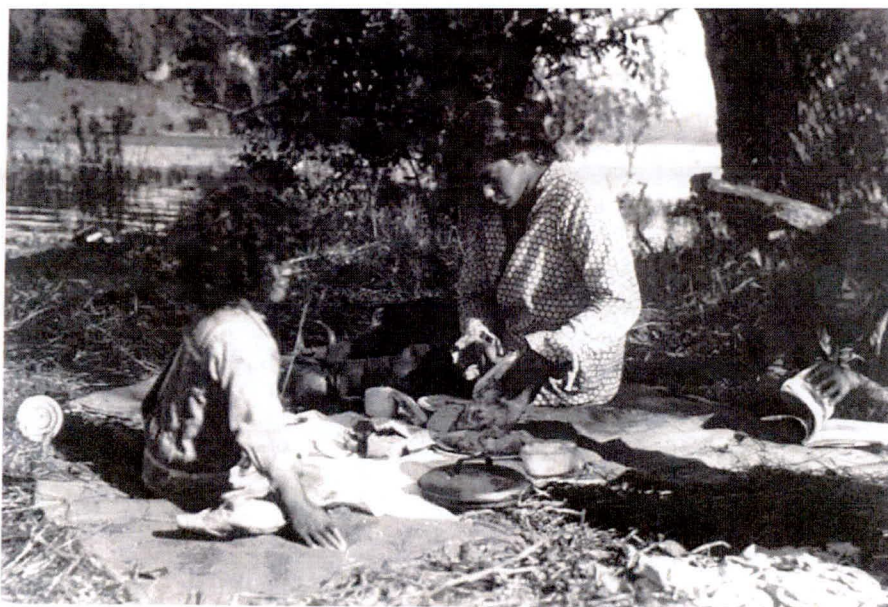
Rotorua Lakes Education Resource – Mōreua 'Now and Then' Photopack