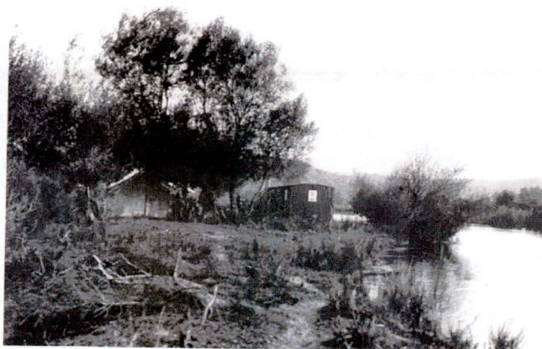
Rotorua Lakes Education Resource – Mourea 'Now and Then' Photopack

Tuhourangi was the favourite son of Rangitihī. His mother, Papawharanui, was the sister of Ruapani, paramount chief of the Tūranga-nui-a-Kiwa district ( ibid , p.58). Tuhourangi is an important figure in the early history of the Rotoiti lakes district for it was his descendants who originally occupied the area prior to Ngāti Pikiao. Kawatapurangi and Rakeiao are also important figures at Rotoiti. Kawatapurangi married Rangikawekura, grand-daughter of Rakeiao. Rakeiao married two women named Kēpare and Maruahaungaroa and had five children. In later life, Rakeiao moved to Okataina where his descendants, Ngamahanga, remained for some time.