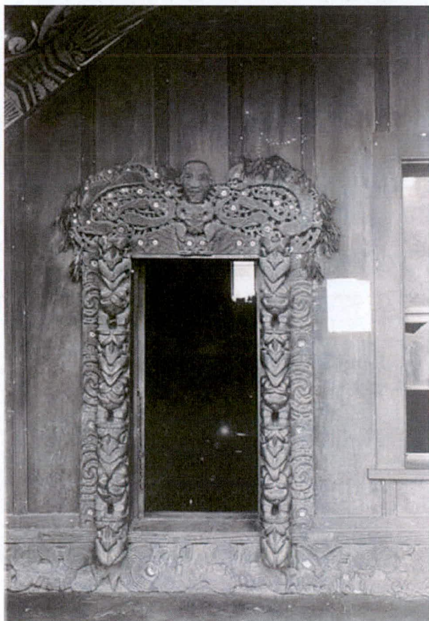
Photograph 13 – Carved doorway, meeting house, Mourea Pa 99

Kaokaoroa, Karaka no. 1 and 2, Kohangakeaea, Kuharua, Mourea, Otaramarae, Pukukiwa, Punga Rehu, Ruahine and Ruahine 1, Taheke 3 – 5, Te Akau, Te Waiatatuhi, Wainui, and Waipapa 1 and 2.