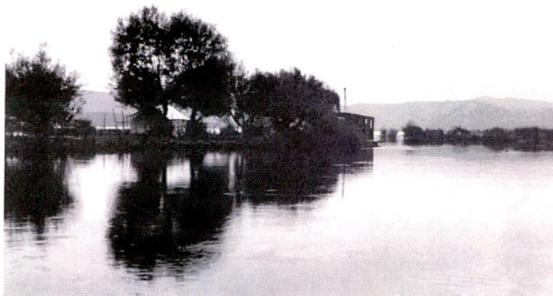
Rotorua Lakes Education Resource – Mourea 'Now and Then' Photopack