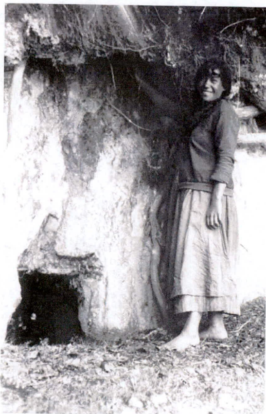
OP-1669 Woman beside half buried food storage cave entrance, Te Weta Bay, Rotoiti

After capturing Motuohiwa Te Takinga had a meeting with his war-party and declared: 'I am avenged'. He instructed the Waitaha warriors to leave the bodies of the dead and return to Rotoehu. The Tuhourangi survivors of these battles were spared by Te Takinga. Later however, he decided to re-declare war and thus gain the entire Lake Rotoiti district for the descendants of Kawatapurangi and Waitaha-a-Hei, once and for all. So he attacked Tuhourangi at Kotipu pā and then returned to Rotoehu and Eastern Rotoiti. After a brief time, Te Takinga decided to go and see the paramount chief of Tuhourangi, Te Rangipuawhe at Motutawa pā to discuss the occupation of Rotoiti lands by his people. However, on his arrival at Motutawa, he discovered Te Rangipuawhe about to embark on a meal of his children and exclaimed: 'Make your meal while there is still light'. To this remark, Te Rangipuawhe was embarrassed and replied: 'I have no payment for the death of your children. My land you can have – I shall go somewhere else'. With that, Te Rangipuawhe gave his remaining land to Te Takinga unconditionally. Following that, Te Rangipuawhe and Tuhourangi left Rotoiti and migrated to Tarawera and Lake Rotokakahi where they named Motutawa in the memory of their Rotoiti homeland ( ibid , p.102).