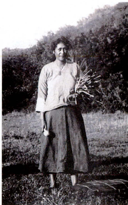
OP-1811 Young woman holding flax. Russell