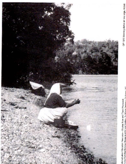
Photograph 6 – Lake edge, Rotoiti 55