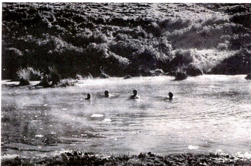
Rotorua Lakes Education Resource – Mounia 'Now and Then' Photopack

While living at Otamarakau, Tahuwera made some explorations inland with the ancestors, Uruika, Matamoho and Tutauaroa. Upon their arrival at the north-eastern shore of Lake Rotoehu they glanced upon the lake and were not very impressed by its muddy appearance. So he named the lake, Rotoehu (Muddy lake). It was here that they also named a place called Te pā o Parehe. After naming a number of places around Rotoehu they returned to Otamarakau by a track called Ohinepuara, known today as Hongi's track. Sometime later, Tahuwera and his wife moved back to the Rotoehu and Rotomā districts where they settled at Maireraunui on Matawhaura mountain (ibid). It is said that Tahuwera eventually died at Rotoehu and is buried at Matawhaura (ibid).