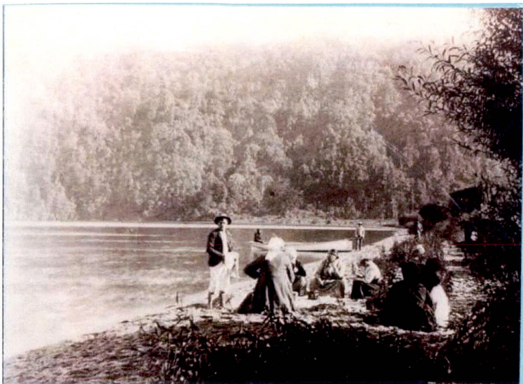
Photograph 10 – Group at Tapuaeharuru 75