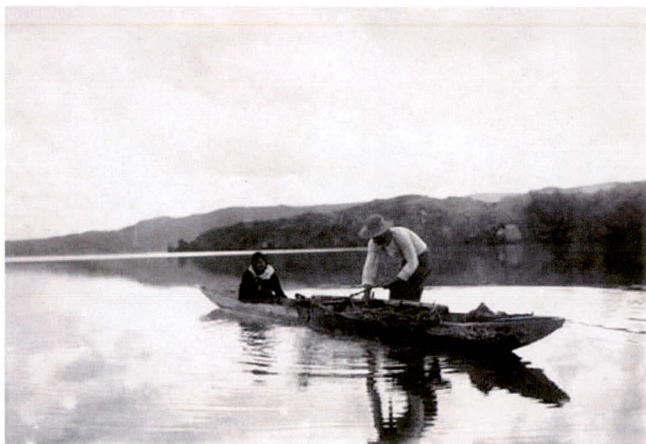
Photograph 11 – Two people fishing from a waka on Lake Rotoiti 94