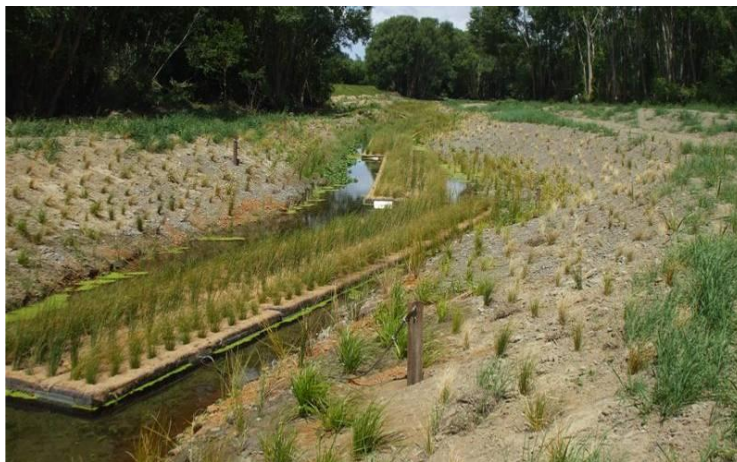
Figure 3. In-channel application of FTW for treatment of agricultural drain-flows into the Tukipo River, Hawkes Bay.