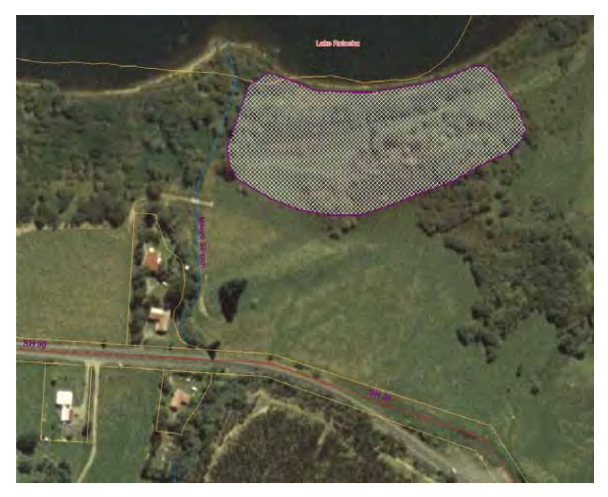
Figure 2 Potential location for a constructed wetland

A 3.2 hectare wetland to the east of Te Maero stream, optimised by adding sawdust as a carbon source for bacteria, could remove about 38% of the nitrogen in Te Maero Stream.